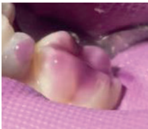
a) The 'etchant'

This is a plastic coating painted into the grooves of the teeth, especially the back teeth (molars). It evens out the surface of the tooth and forms a barrier to stop plaque building up. A special liquid 'etchant' (image a) is applied and then the tooth is washed and dried (image b). The plastic coating is painted on and hardened using a bright light (images c and d). Like fluoride varnish, this is an additional protection against decay but children still need to brush their teeth thoroughly morning and night and limit sugar to mealtimes.