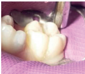
b) Tooth washed and dried