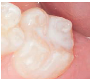
d) Close up of coating