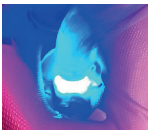
c) Blue light